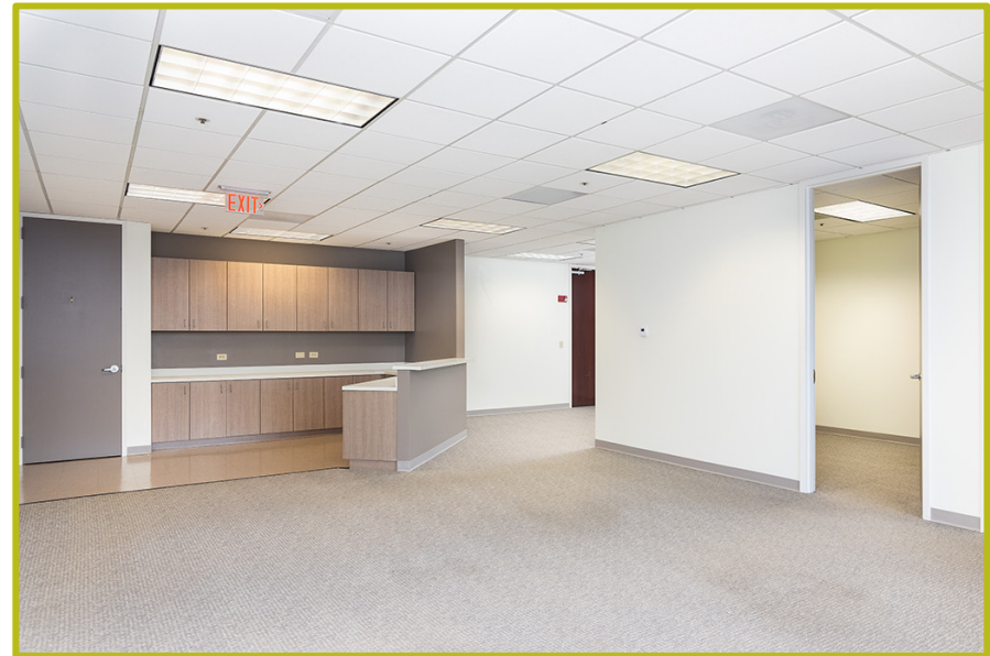
Move in Ready / SPEC suite Furniture shown for example purposes